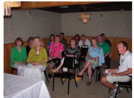
A gathering for the Joyce readings.