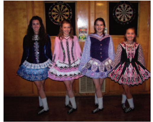
The O'Maoileidigh Dancers.